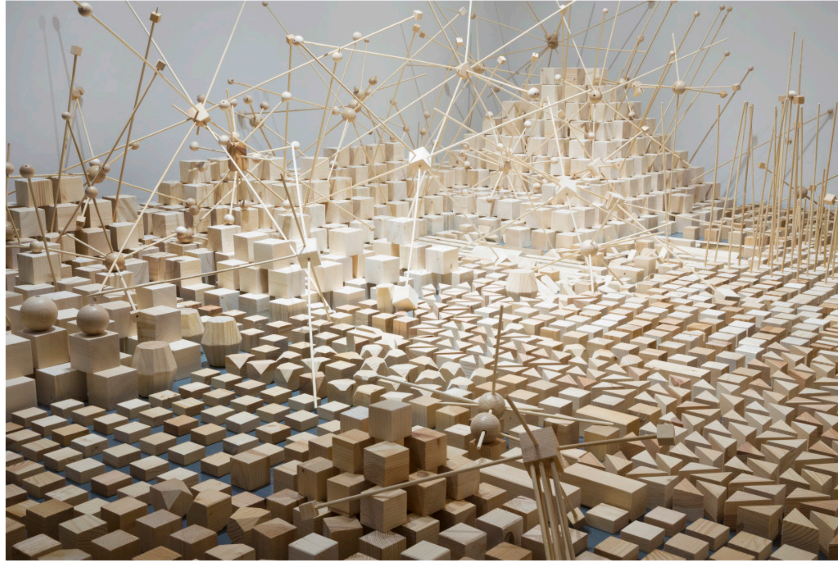
© Eamon O’Kane, 2017.

Does all the beauty of the world cease when you die? continues in Butler Gallery until June 11th, full details available here .